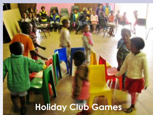
Holiday Club Games

Combined Christian Ministries to the Poor First National Bank Cheque Acc: 62000371170, Branch: Newton Park, Branch Code: 261050, Swift Code: FIRZAJJ