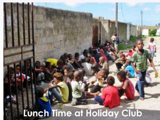
Lunch Time at Holiday Club