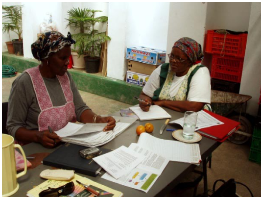
Volunteers reviewing household assessments