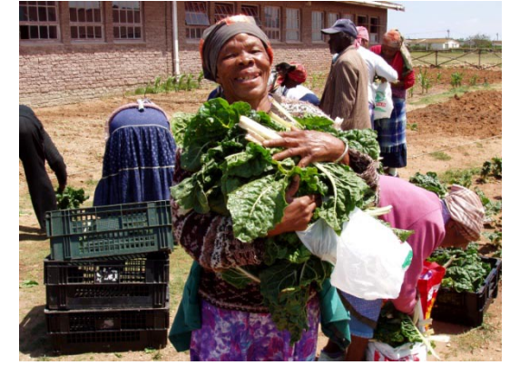
Food garden harvest