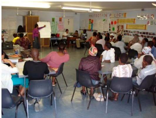
Volunteer training workshop