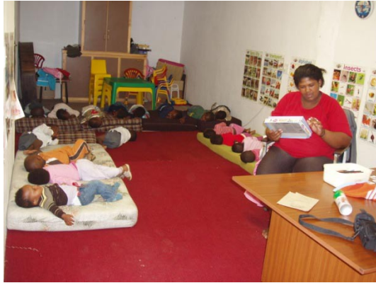
Educare nap time