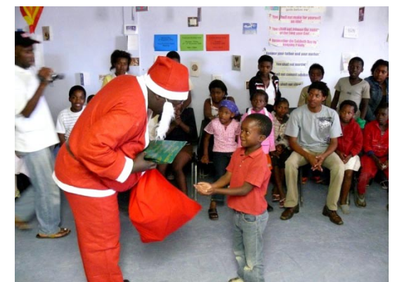
Year-end party awards