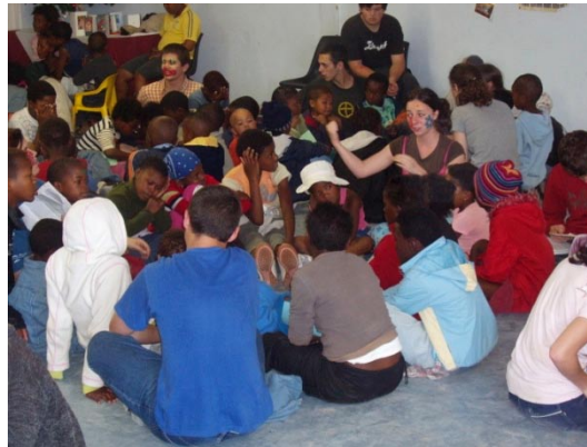
Holiday club for community OVC's