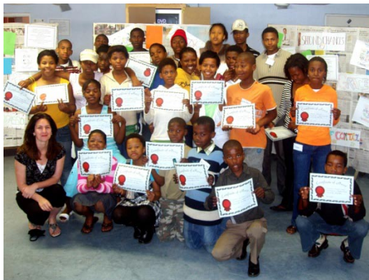
Teen youth holiday drama/self-worth program graduation