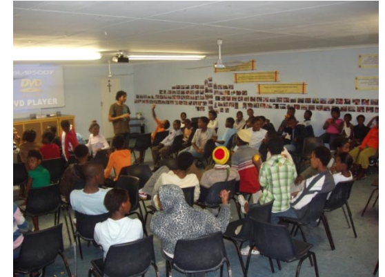
Teen youth discussion