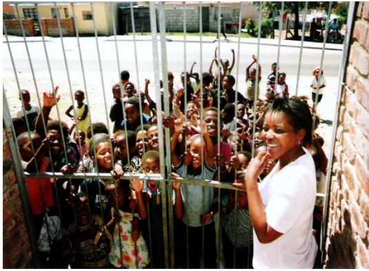
Community OVC's arriving at the Centre