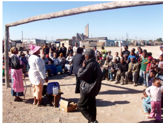
Community awareness campaign