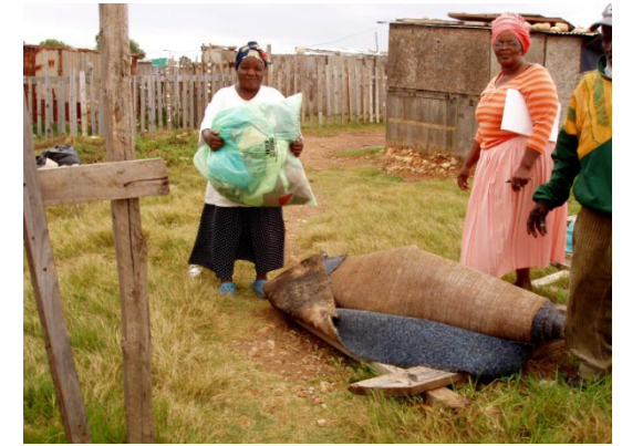
Supplying a community OVC household with some basic needs.