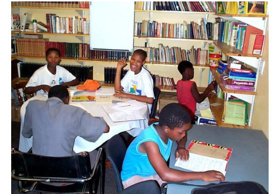
Teens studying in the resource library