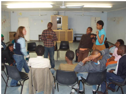
Teen youth holiday drama/self-worth program