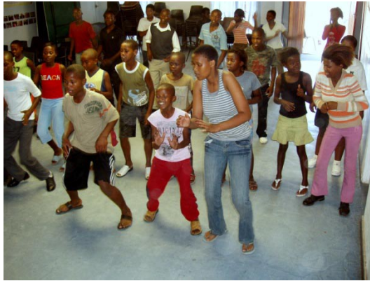
Singing & dancing during a youth program